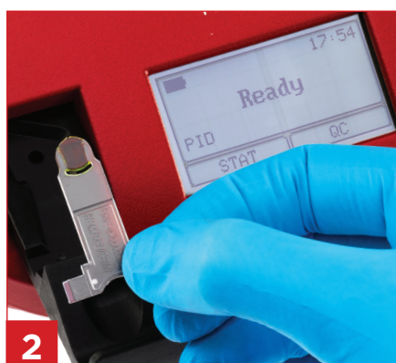
2 Put microcuvette into analyser.