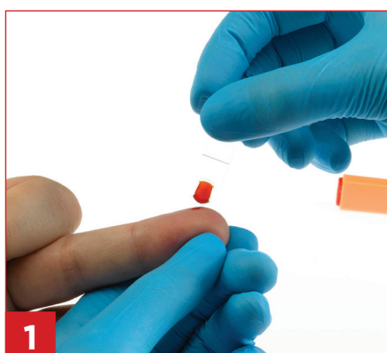
1 Collect blood sample.